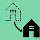
Displacement & Dispossession