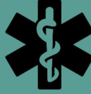
Drug treatment programs